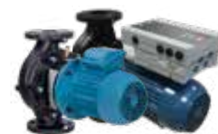
CL, ECL, CV, PV (in-line, with frequency converter)