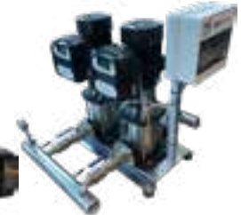
BL, BWJ (multi-stage)