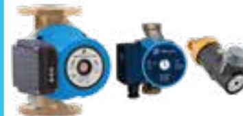
SAN - for sanitary water