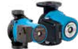
GHN (3-speed pumps)