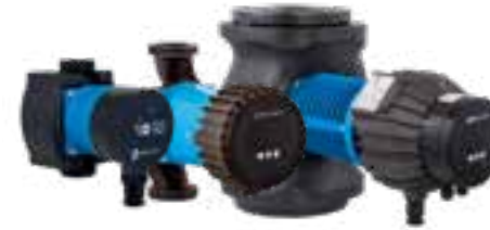
NMT (electronic savings, ECM, SAN circulation for sanitary water)